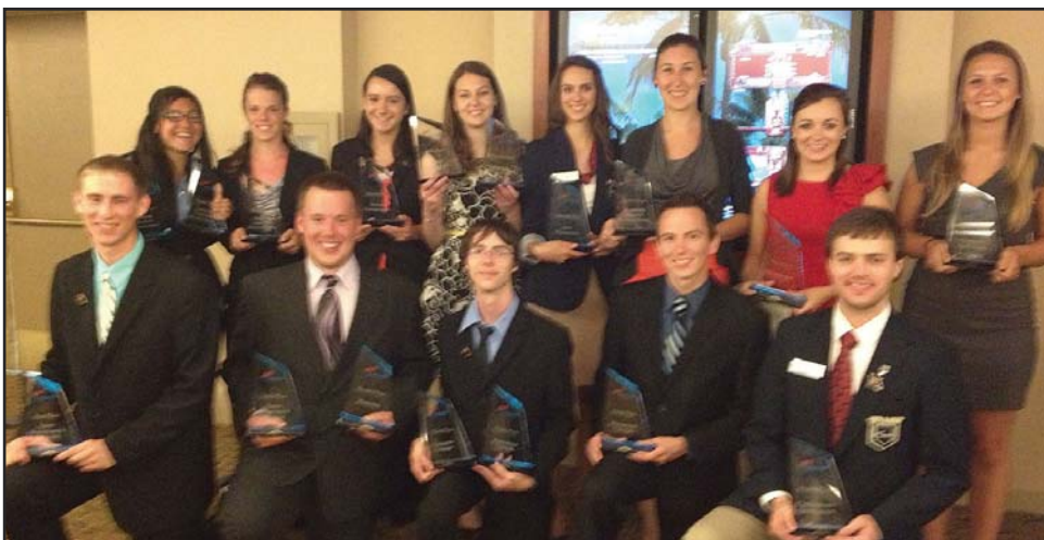
↑ Missouri Phi Beta Lambda (PBL) Students

Missouri FBLA and PBL have started off this year with the theme of: Excellence in Action. This fall, all levels of the organization — middle, FBLA, and PBL — will meet for the first-ever Missouri Fall Conference at St. Charles Community College. Many activities and events are being planned by local chapters to make Missouri FBLA shine again at the 2014 National Conference!