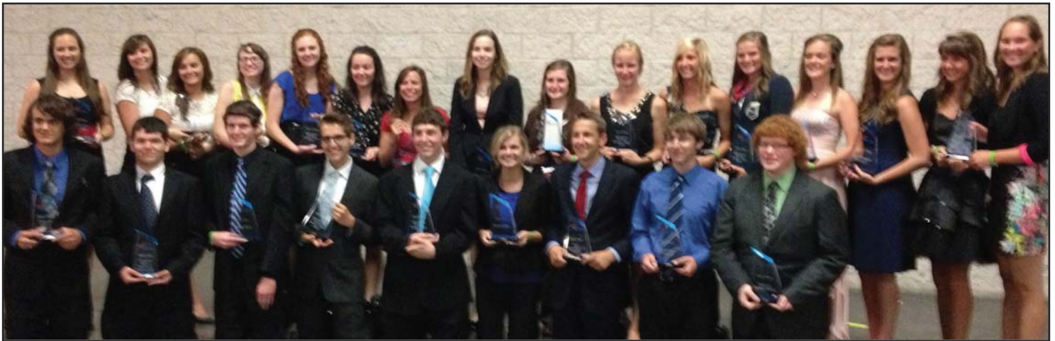
↑ Missouri Future Business Leaders of America (FBLA) Students

The Future Business Leader of America (FBLA) and Phi Beta Lambda (PBL) chapters of Missouri attended the National Leadership Conference in Anaheim, California, at the end of June.